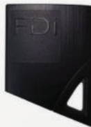
FDI (All colours)