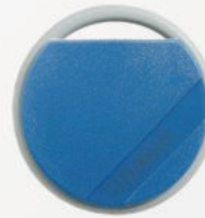
BTICINO (All colours)